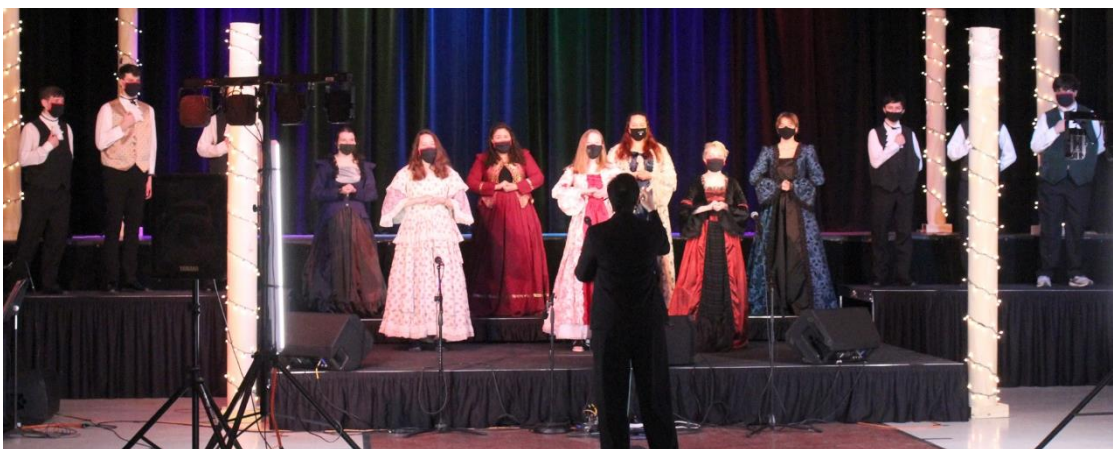
The Chamber choir performing at the Variety Show on March 26 th .